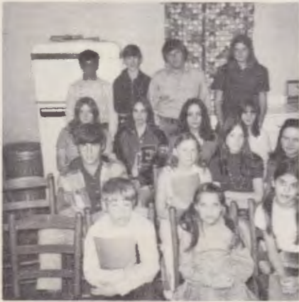
Pastor's Membership class