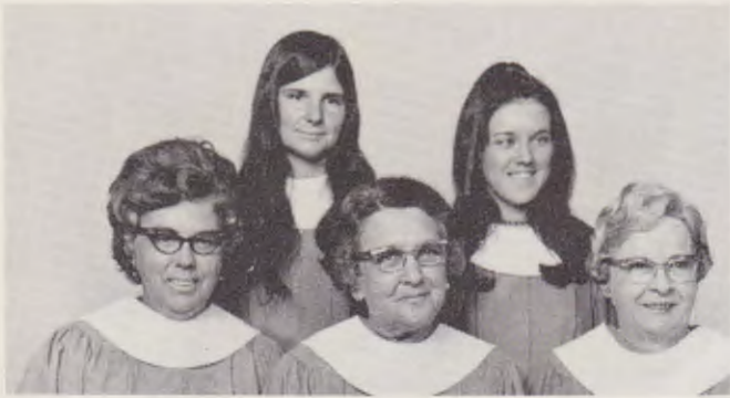
Pianists and Organists