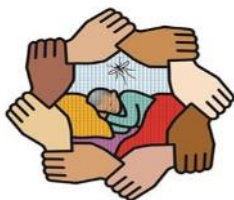
We Are God's People Connected: A Focus on Global Health

1. DO NO HARM to others in our thoughts, words, and actions. This first rule challenges us to be kind and just in all our dealings with others. We commit to protecting the vulnerable and speaking up for the least of these.