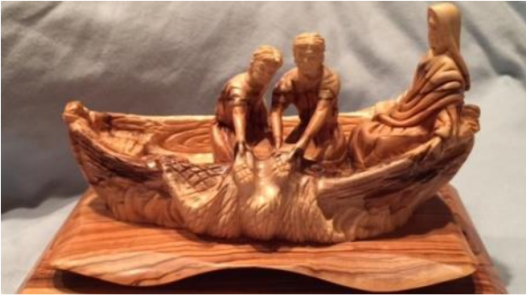
Olive wood sculpture from the Holy Land now at home in our Family Life Center display case.